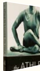
THE ATHLETES GUIDE TO YOGA By Sage Rountree